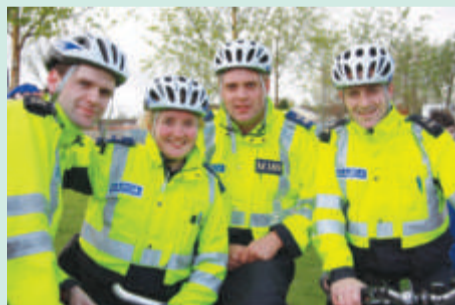
Mountain bike patrol at the Tallaght Spring Clean.

The Community Policing Unit at Tallaght Garda Station organised a Spring Clean in the St. Aongus Parish/Bancroft area. The event was run in conjunction with An Taisce's "National Spring Clean Month". Students from participating schools collected litter from school grounds and local housing estates and helped with planting flowers and shrubs. The Spring Clean was supervised by local residents, teachers, members of the Castle-Combined Residents Association Committee and Park Rangers from Tymon Park. Community Gardaí were also on Mountain Bike Patrol throughout the day. This was the first time a Spring Clean event took place in the St. Aongus Parish/Bancroft area and it was very well received by the community. It is hoped that the Spring Clean will become an annual event.