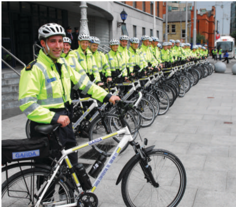
The launch of the expanded Garda Mountain Bike Unit in July 2008.

The Unit has proved extremely popular, with positive feedback received from both local communities and business groups. The expansion represents an increase of one third to the strength of the unit and sees a further 130 bikes allocated throughout the country, bringing the total to just over 500, with some stations receiving an allocation for the first time and establishing new Mountain Bike Units.