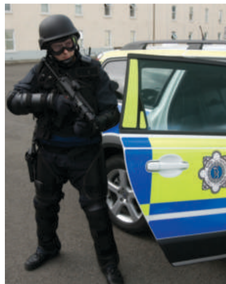
Regional Support Units provide support to other units in the event of a critical incident.

During 2008, the SDU was involved in numerous investigations and operations