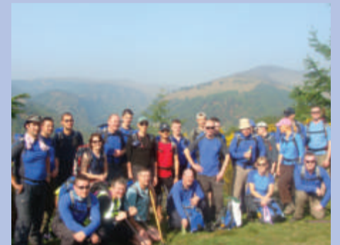
Members of the Garda Mountaineering and Canoe Club were blessed with lots of sunshine on their charity trek over the Wicklow Way.

Members from the Garda Mountaineering and Canoe Club, which was established in 2007, completed the Wicklow Way in a record three and a half days in May 2008. The group of 35 (including support crew) raised €27,000 for the Laura Lynn Foundation, which provides respite care for terminally ill children, and the Irish Mountain Rescue Foundation, which provides mountain rescue all year round on a voluntary basis.