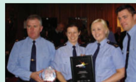
Gardaí from Fitzgibbon Street with the Media and Multicultural Award presented for the On-Line and Web category.