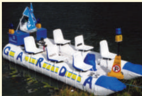
The Garda raft which competed in the Mallow Search and Rescue Raft Race.

For the first time, members from Mallow Garda Station took part in the Mallow Search and Rescue Raft Race . The annual race runs on an 8km stretch of the river Blackwater between Mallow town and Killavullen. The Garda raft came in fourth position out of 40 and the team won the Best Newcomers award. The raft was constructed at Mallow Garda Station by an eight-person team. The trophy is now proudly on display at Mallow Garda Station.