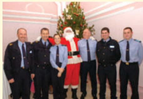
The third annual Christmas Reception was a great success.