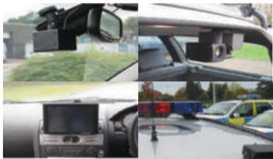
Automatic Number Plate Recognition systems make a significant contribution to the fight against serious and organised criminal activity.

On completion of a tour of duty or periodically, captured ANPR and video footage is transferred from the vehicle to stand-alone ANPR PCs which are positioned at a number of traffic locations throughout the country.