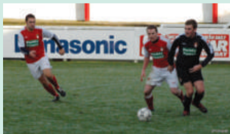
Gardaí from Kilmainham and Kevin Street battle it out.

The annual soccer match between Gardaí from Kevin Street and Kilmainham stations took place at Richmond Park in December 2008. Over 500 children from national schools in both districts came along to support their local Gardaí. Dublin Bus provided transport and Glanbia provided light refreshments. Half time entertainment was provided by the arrival of Santa Claus and a raffle in aid of St. Patrick's Athletic Club. A very enjoyable day was had by all.