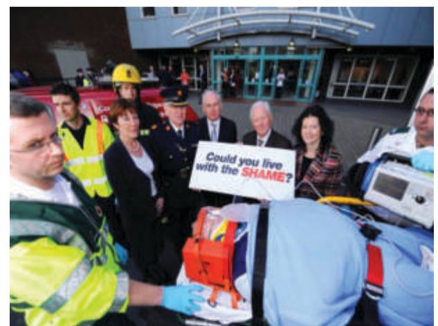
The launch of the Christmas Anti-Drink Driving Campaign in November 2008.

An Garda Síochána's annual Christmas and New Year Road Safety Campaign ran for a six-week period from midnight on 24th November, 2008 to midnight on 4th January, 2009. The campaign included road safety enforcement operations in every region, consisting of high visibility patrols and mandatory alcohol testing checkpoints.