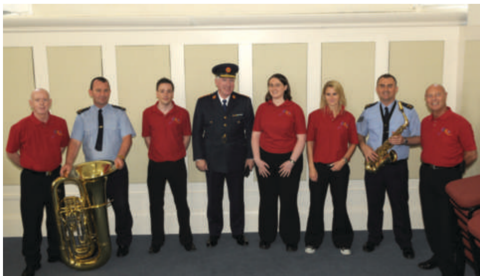
Members of Gloria visit with the Garda Commissioner and members of the Garda Band in June 2008.

event. The strong relationship which exists between An Garda Síochána and the gay community is a result of close partnership and cooperation over the past ten years and the concert offered a fitting opportunity to celebrate that relationship through music and song.